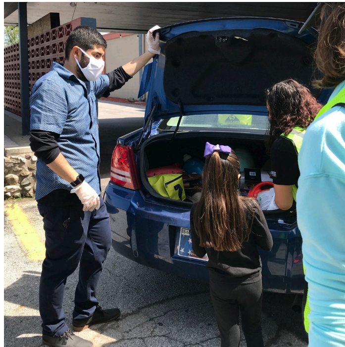
Volunteers distribute free food to families affected by the Covid pandemic outside of the Arena in Elkhart

1 in 4 lives touched by United Way-funded programs