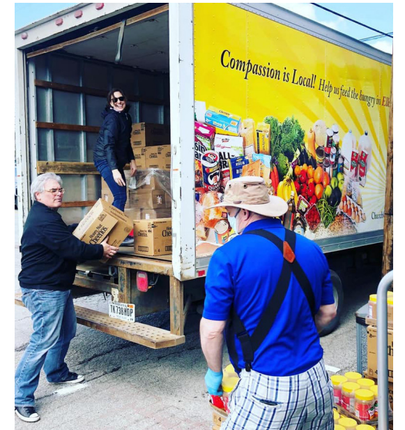
Staff delivers much needed food assistance. Spring 2020 saw an unprecedented spike in demand at local pantries.

As businesses closed their doors in the Spring of 2020, many of our neighbors suddenly found themselves furloughed or out of work and struggled to meet basic needs. When families like Ana's needed a little extra help, United Way donors filled the gap, providing a crucial safety net for those facing temporary crises.